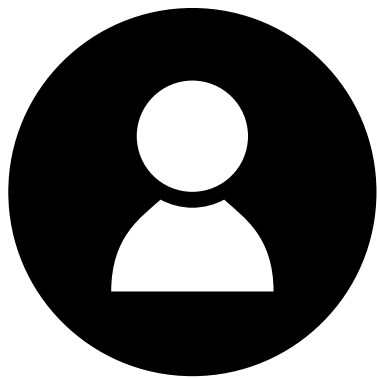
Vacancy Vicar minister@ stjohnssouthbourne.com